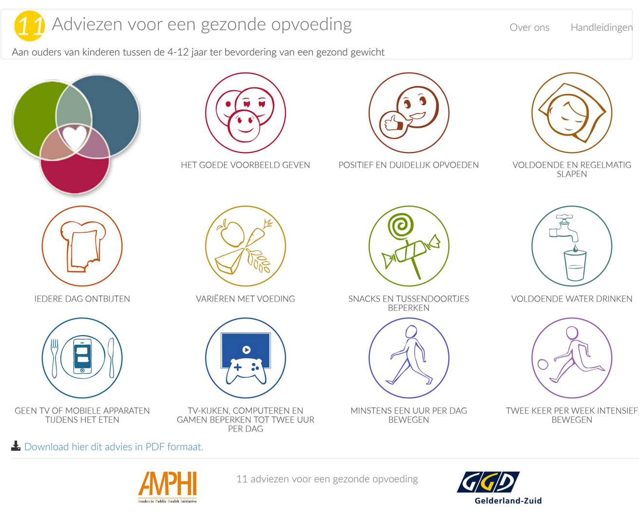
Fig 2. Screenshot of the web app "11 recommendations for healthy parenting".

https://doi.org/10.1371/journal.pone.0231245.g002